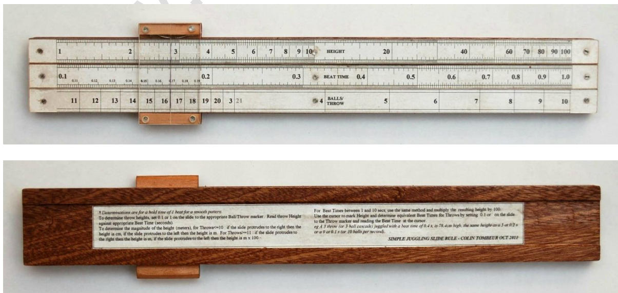
Fig 1 Simple Slide Rule, front and back.

Here is the result, a simple juggling slide rule, top, and a more complex one below: